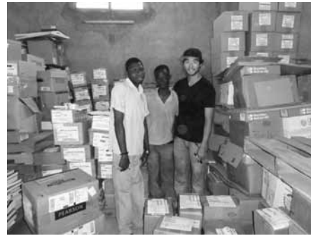
BBF-donated books being sorted for distribution in Ghana

Brother's Brother Foundation and the Rotary Club of Tema, Ghana have been in partnership since the early years of BBF's education program. Every year BBF provides several container loads of donated books to support the Rotary's educational programs throughout Ghana. These programs include building libraries, supporting schools and universities and continuing adult education. In 2013, BBF sent four container loads, collectively holding 67,582 books, to support these programs in Ghana.