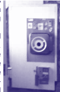
Recently installed BBF-donated autoclave at Mulanje District Hospital

beds that have extremely thin mattresses (and, in some cases, no mattress), no way to monitor vital signs of a patient in the operating theater's "Recovery Room," a laundry with no functioning washer or dryer, etc. The hospital clearly would benefit from working with BBF. It is located only an hour from Mulanje, where BBF will be sending a third container this fall. I was impressed with Sister Mercy and her "pro-active" approach. She told me that she learned about BBF by Googling "organization that deals with used medical equipment" and when she saw on our web site that BBF sent material to Malawi, she decided to reach out. At the end of the day, the hospital's needs are almost endless. I hope that BBF will be able to find a way to help.