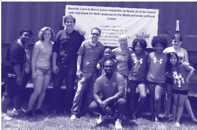
Hope for Lives in Sierra Leone loaded in July in Dickerson, Maryland

The World Health Organization and Médecins Sans Frontières (MSF, Doctors Without Borders) both reported that the numbers of suspected and reported cases did not reflect the true scale of the crisis. In addition to the large quantity of donated medical supplies already shipped by BBF to these countries in critical need, BBF committed $200,000 of its financial resources to assist international partners as they responded to the outbreak. Strong support from BBF's community of donors allowed us to continue to provide vital medical supplies to hospitals and clinics in west Africa.