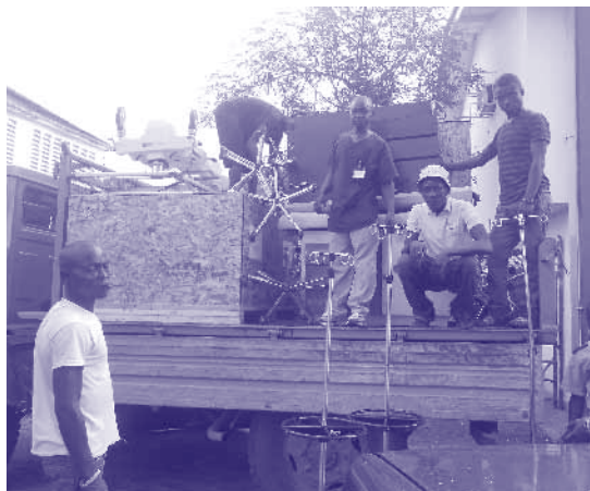
BBF donated medical supplies and equipment being distributed in Sierra Leone

The Ebola outbreak in west Africa was one of the largest Ebola outbreaks in history, impacting a number of countries including Guinea, Liberia, Nigeria and Sierra Leone. BBF has longstanding relationships with the two countries that experienced the highest burden of suspected and confirmed cases of Ebola, Liberia and Sierra Leone. Among the poorest countries in the world, their healthcare infrastructures were ill-equipped to deal with the outbreak. BBF is working to help fill some critical supply gaps in 70 hospitals and clinics based on requests for assistance from the Ministry of Health in Liberia and other BBF partners. Shipments of liquid soap, gloves, masks, gowns, IV poles and other general medical supplies were sent to our partners in these countries.