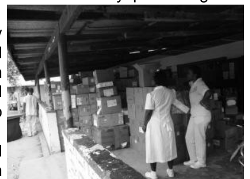
Medwish supplies in Liberia

MedWish International provides donated medical supplies to individuals and organizations dedicated to providing care that directly alleviates the suffering of people in underserved areas regardless of religious or political affiliation.