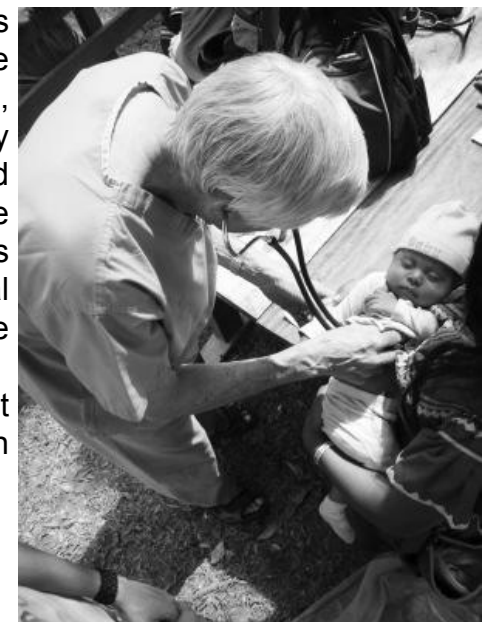
Clinic visit in Panama