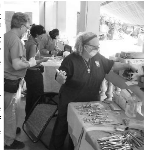
Mission clinic at work in Haiti