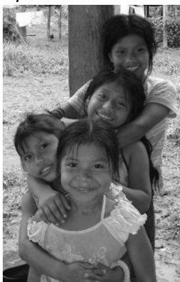
Ngöbe Indians of coastal Panama

Thanks in part to the donation of medicine from Brother's Brother Foundation, we had a completely successful trip serving the Ngöbe Indians of coastal Panama. The trip occurred January 20-28, 2011. Five of these days were fully devoted to serving approximately 2000 Ngöbe Indians in coastal villages, reached by boats and canoes, along the inland bay area of the Valiente Peninsula of the Bocas del Toro region of North-Western Panama. All the medications provided by BBF were either used, distributed or left with our local partner in Panama for continued distribution by qualified healthcare personnel.