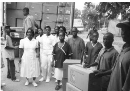
Medwish supplies in Liberia

BBF recently sent a donation of medical supplies from MedWish International in Cleveland to Ganta Hospital in Liberia. In its thanks, the Ganta Hospital staff also expressed gratitude to BBF for providing funds to defray the costs of in-country processing and customs.