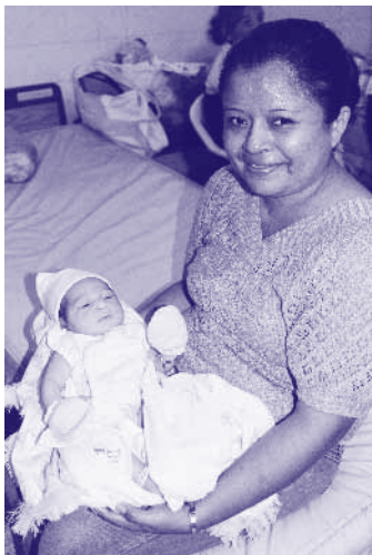
A proud relative shows off a newborn baby boy at Hospital de Area Puerto Cortés. This hospital receives medicine, equipment and medical supplies from BBF and sees an average of 180 births in a month.