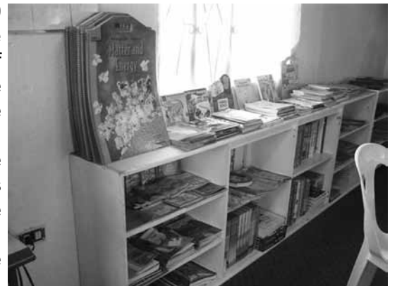
BBF books in the Philippines