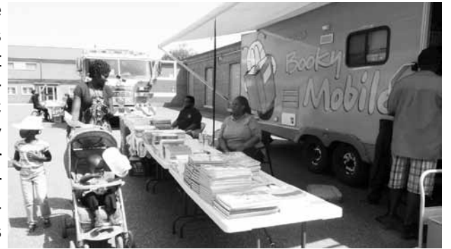
Tri-County OIC Booky Mobile

June the 6th was the perfect day to visit Tri-County IOC and the Booky Mobile for their Summer Reading Kick-off event. This event was to encourage