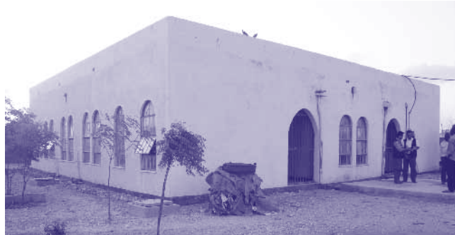
The El Wak clinic, located on the border of Kenya and Somalia

BBF and ADRA are working to help thousands of refugees along the border of Kenya and Somalia at the El Wak clinic. BBF sent the clinic a container of requested medical supplies that included gloves, sterilizers, surgical instruments, operating room tables, hospital beds with mattresses, exam tables, wheelchairs and other valuable pieces of medical equipment. BBF and ADRA will continue to work together assisting these refugees in the coming months.