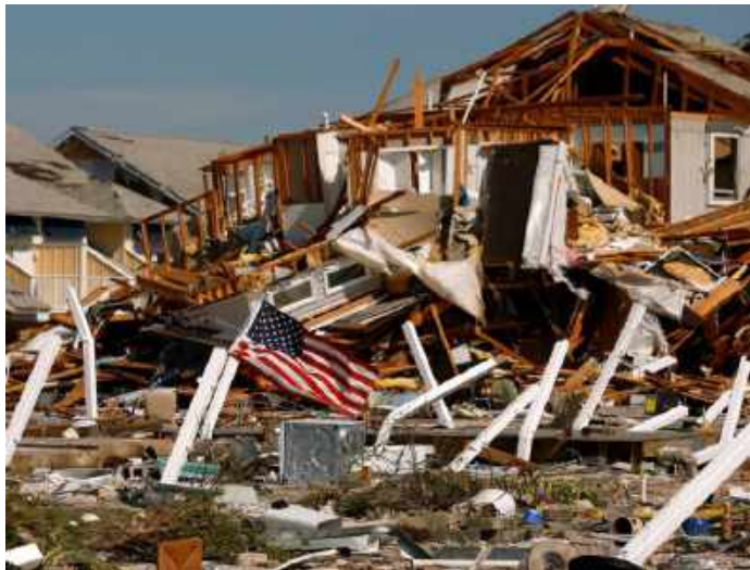
Hurricane Michael damage in Tallahassee, Florida